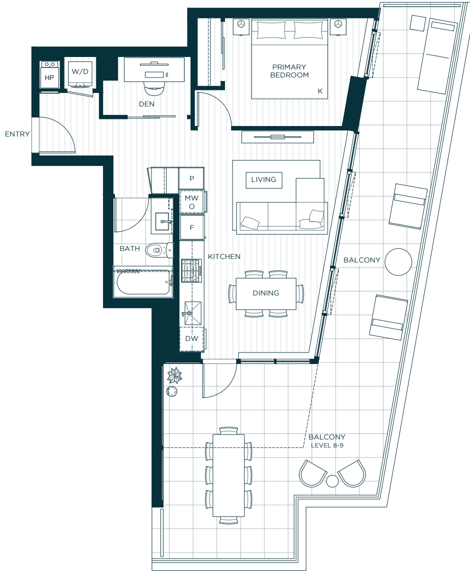
BALCONY LEVEL 7